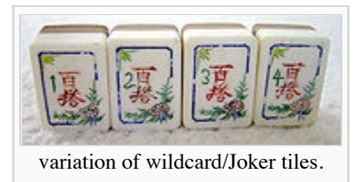
variation of wildcard/Joker tiles.

Unique to American sets are eight Joker tiles, tiles that simply say "Joker" in a diagonal pattern on them. Often in Chinese the words 百搭 bǎidā 'a hundred connections' are seen. Four joker tiles are used in Shanghai style Mahjong too. Joker tiles can also be used to replace any tiles in putting together a hand.