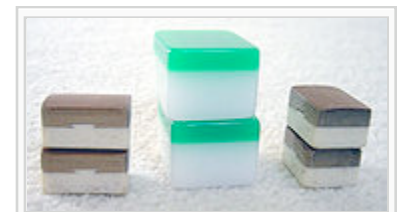
Plastic vs. ivory/bamboo tiles

Mahjong tiles have been constructed from various materials throughout the years. Traditionally, Mahjong tiles were constructed bone, often backed with bamboo. Bone tiles are still available but most modern sets are constructed from various plastics such as bakelite, celluloid, and more recently nylon. There are a small number of sets that have been made with ivory, but these are exceedingly rare: most sets sold as ivory are in fact made from bone. Regardless of the material used to construct the tiles, the symbols on them are almost always engraved or pressed into the material. There are generally two sizes available, the larger Chinese – Cantonese size and the smaller Chinese/Japanese/American size. Some expert players can determine the face value of their tiles without actually looking at them by feeling these engravings with their fingers.